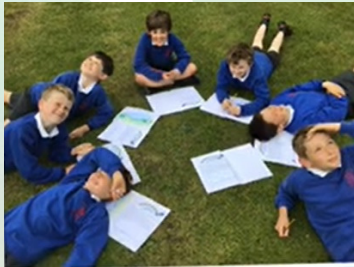
Connecting with nature