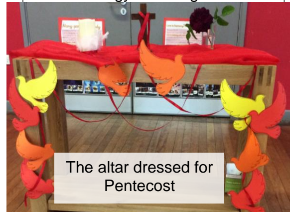
The altar dressed for Pentecost