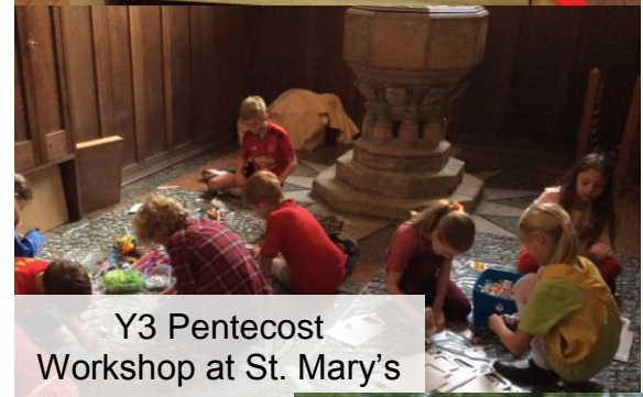
Y3 Pentecost Workshop at St. Mary's