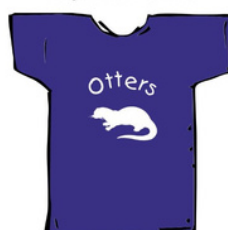
Royal Blue - Otters