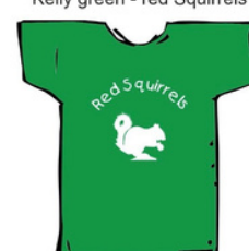
Kelly green - red Squirrels