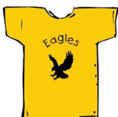
Yellow - Eagles