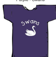
Purple - Swans