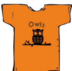
Orange - Owls