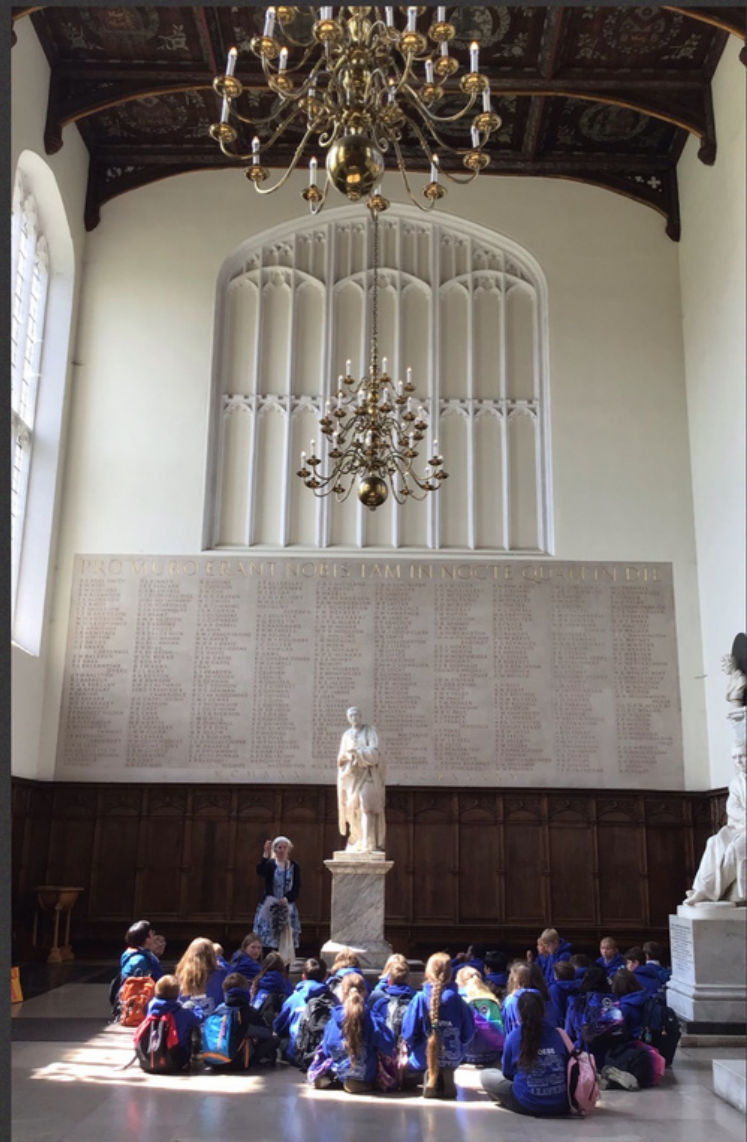
Y6 Darwin Trip