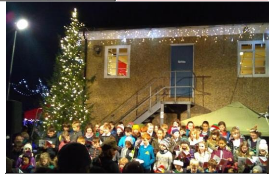
Choir singing at Great Shelford Memorial Hall